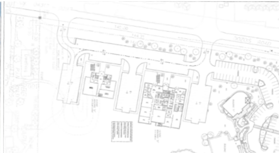
SK-SP2 SITE PLAN - SOUTH SOUTH POINTE COMMERCIAL DEVELOPMENT