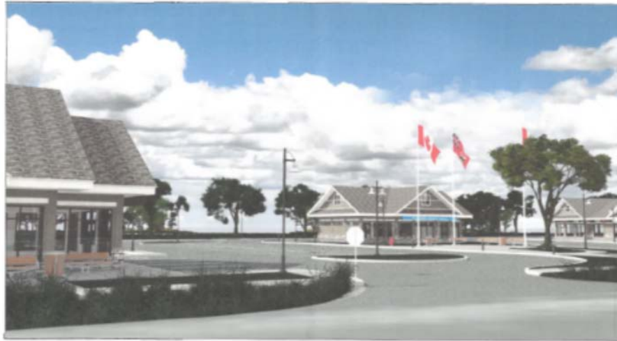
RENDERING - STREET VIEW LOOKING NORTH EAST SOUTHPOINTE COMMERCIAL, MANDICK, ONTARIO