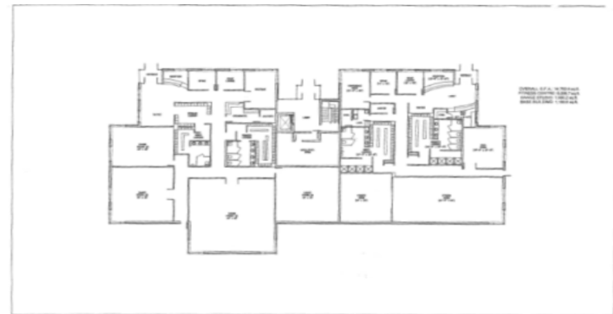
SK-2 BUILDINGS "D" - Option 2 SOUTH POINTE COMMERCIAL DEVELOPMENT