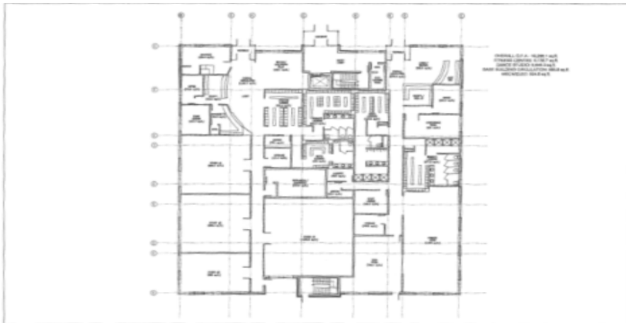
SK-1 BUILDINGS "D" - Option 1 SOUTH POINTE COMMERCIAL DEVELOPMENT