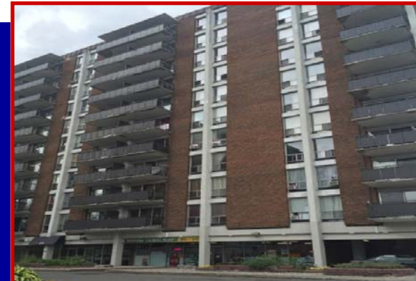
230 Brittany Drive, Ottawa, ON